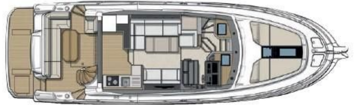
MAIN DECK - PONT SUPÉRIEUR